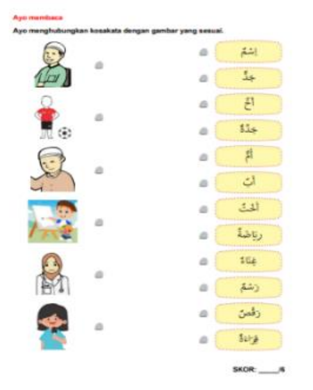
Figure 4. Examples of Language Exercises

In the Arabic book KSKK grade 1 MI, the language tasks include tasks or exercises of four skills in learning Arabic, including practice of writing, reading, listening and speaking skills. The assignments presented in this book are written simply and easily, adjusted to the level of students' abilities which in the CEFR standard are referred to as Beginner A1 (beginner) and Elementary A2 (basic) levels, as well as adjusted to the teaching material in each chapter. In addition to the linguistic tasks in each chapter (formative evaluation), this book is also equipped with exercises at the end of the semester and the end of the year (summative evaluation) to measure students' ability to master the teaching material. The following is an example of a language training assignment in the KSKK MI Arabic textbook for grade 1.