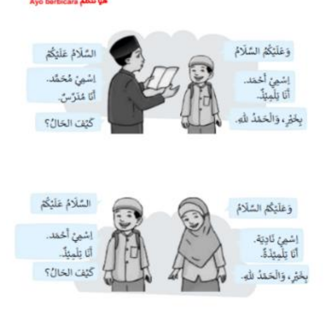
Figure 3. Examples of Qira'ah and Kalam Texts

In the Arabic textbook MI grade 1 KSKK, the text is made simple and concise which is adjusted to the level of students' ability, which in the CEFR standard is referred to as the Beginner A1 (beginner) and Elementary A2 (basic) levels (North 2007). In this book, texts are used to train students in qiroah and kalam skills. The following is an example of text in the Arabic teaching material MI grade 1.